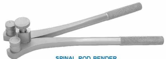
SPINAL ROD BENDER Code No.: 390.056