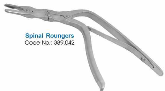
Spinal Rongeurs Code No.: 389.042