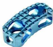
TLIF CAGE - TITANIUM