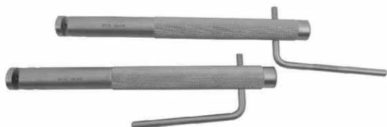
Tube Rod Bender 1 Set (Two Pcs) Code No.: 206.016