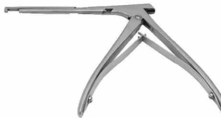
Punch Forceps-Small-Downcutting Code No.: 389.004