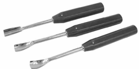
CAPNERS/COBB SPINAL GOUGE STAINLESS STEEL