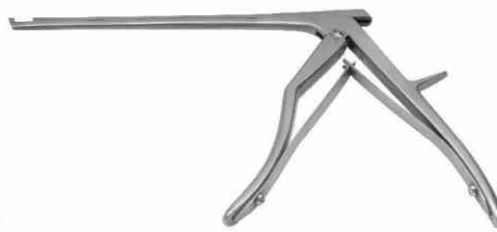
Punch Forceps-45° Angle-Upcutting Code No.: 389.010