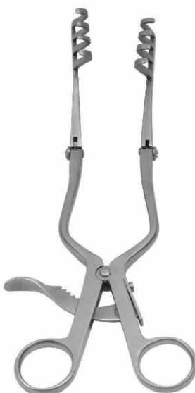
SELF RETAINING RETRACTOR STAINLESS STEEL