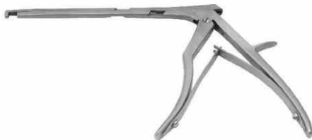
Punch Forceps-Large-Downcutting Code No.: 389.008