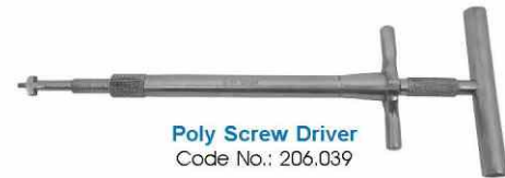
Poly Screw Driver Code No.: 206.039