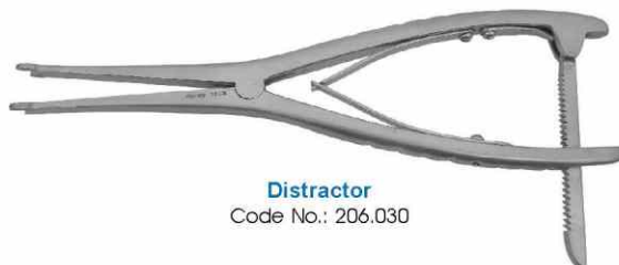
Distractor Code No.: 206.030