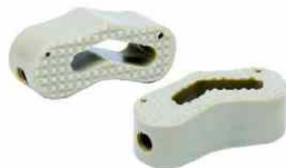
PEEK KIDNEY CAGE - TYPE I