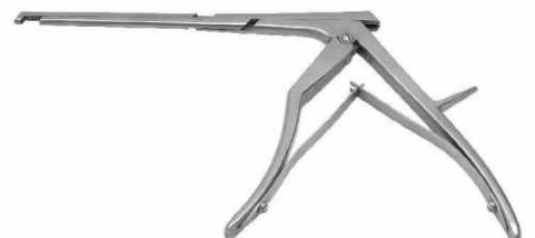
Punch Forceps-45° Angle-Downcutting Code No.: 389.012