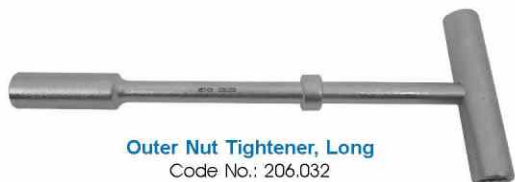
Outer Nut Tightener, Long Code No.: 206.032