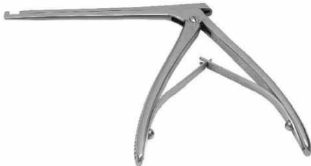
Punch Forceps-Small-Upcutting Code No.: 389.002