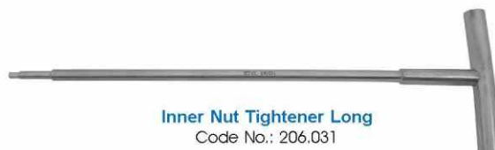
Inner Nut Tightener Long Code No.: 206.031