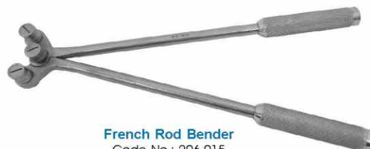
French Rod Bender Code No.: 206.015