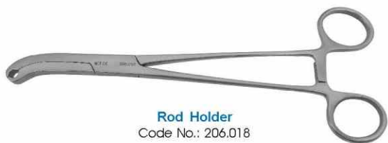
Rod Holder Code No.: 206.018