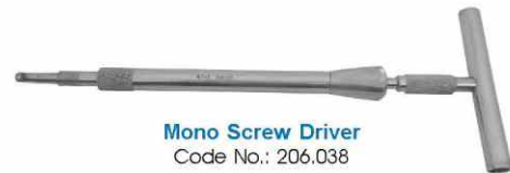
Mono Screw Driver Code No.: 206.038