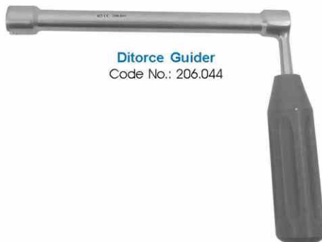
Ditorce Guider Code No.: 206.044