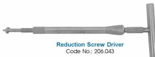
Reduction Screw Driver Code No.: 206.043