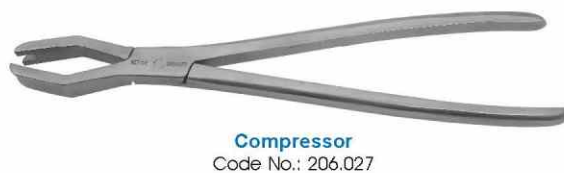
Compressor Code No.: 206.027