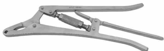
Wise Grip (Rod Clamp Long) Code No.: 206.029